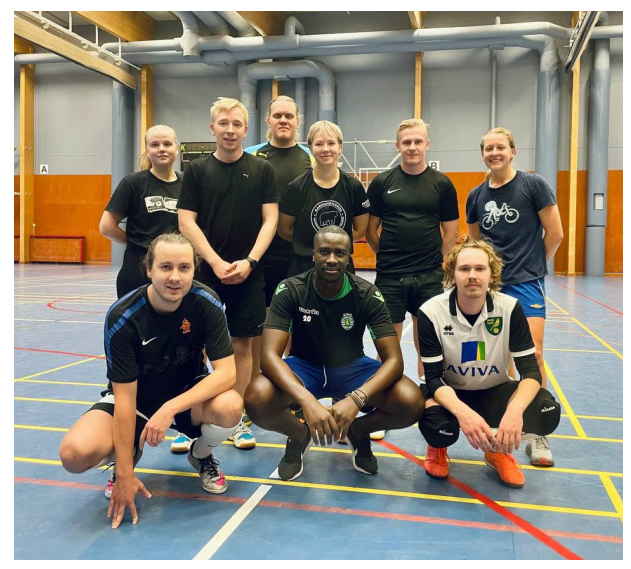
ViPa after fast-paced futsal game in Kumpula UniSport

Check and join the Telegram group from our instagram @mmyl_ry!