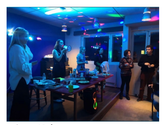
Suomi Night 2023

International sitsit is MMYL's and other organizations own version of traditional "sitsit" mainly for exchange students.